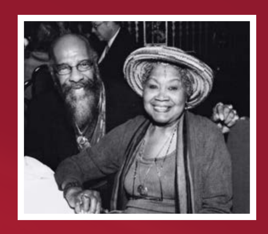
Richie Havens & Odetta 2003